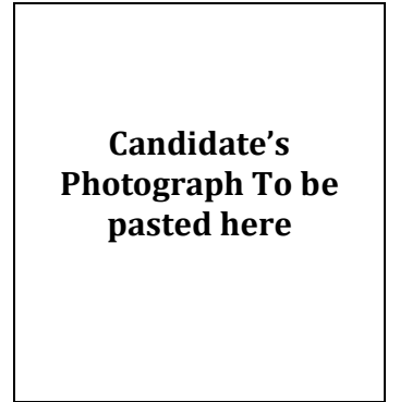
Photo & Signature to be attested by the Hony. Director Centre for Distance & Open Learning, Jamia Millia Islamia

Course in which he/she wishes to be examined (Mentioned option of Courses, if any). Title of Courses